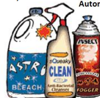
Any Liquid Chemicals including Cleaners and Pesticides