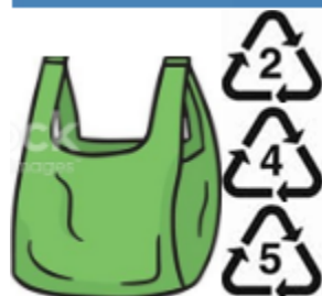
Plastic Films #2,4,5

Some exceptions and fees may apply Check with your local Transfer Station