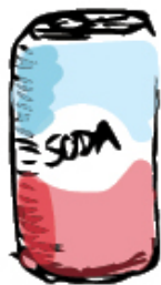
Aluminum Cans and Foils