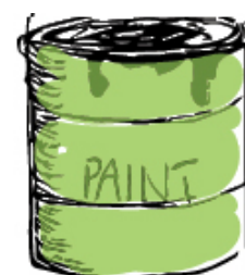
Paints, Thinners, Varnish, Stains

Drop-off at Recycling Center in Lyndonville. May-Oct. Call (800) 734-4602 to Schedule Appt.