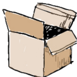
Cardboard and Boxboard